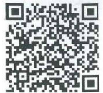
Catholic Welfare Services

C.W.S. LENTEN APPEAL ENVELOPES are available at the church entrances. Parishioners are encouraged to do charity and almsgiving during the Lenten season.