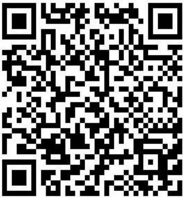
Blessed Sacrament Church

Parishioners can make your donations via SPayGlobal by scanning this QR code. Verify that the recipient is 'Blessed Sacrament Church' before confirming the transaction.